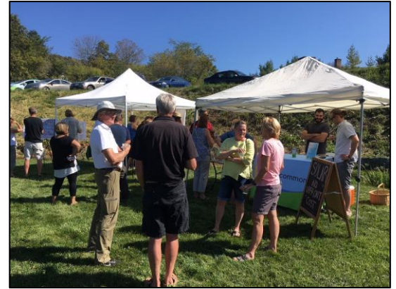
September Green Drinks featured Solar Beer in the East End Park

In other East End efforts a firm was hired with a grant from the Woodstock Economic Development Commission to produce the East End Gateway Conceptual Plan which is an exploration of redevelopment in the East End and is intended to help the community understand the scale of potential development and to visualize new uses and activities in the area.